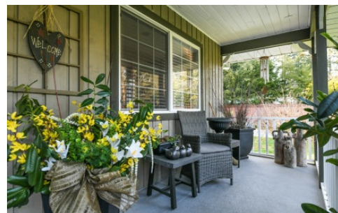
6519 Mystery Beach Road, Buckley Bay. Approx. total finished floor area 2064 sq.ft.